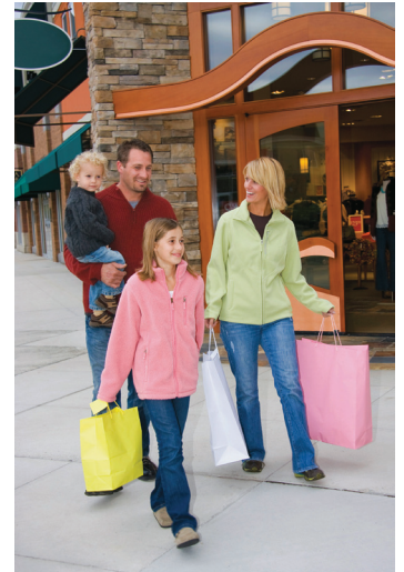
The average Christian Family earns over $80,000 per year. (Nearly twice that of the national median)